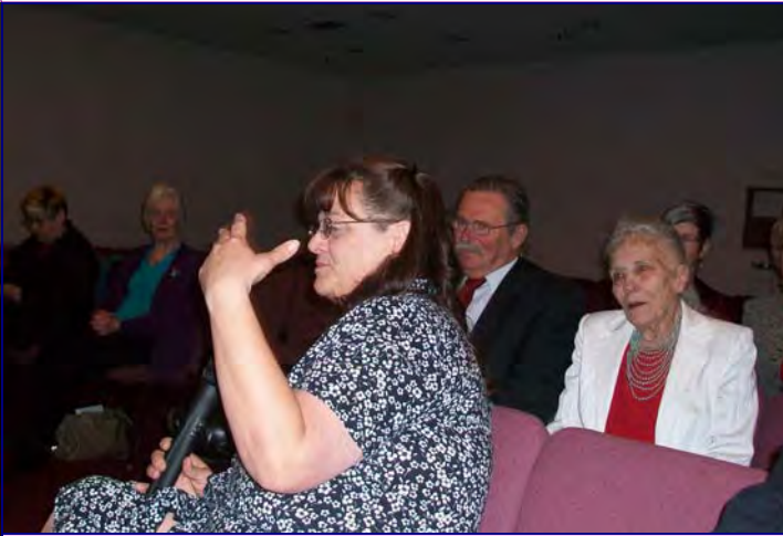
Sande's support system sits behind her